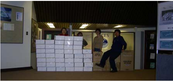
Final countdown and getting ready to go ... The Secretariat sends a big shipment of materials to Honolulu about 10 days ahead.