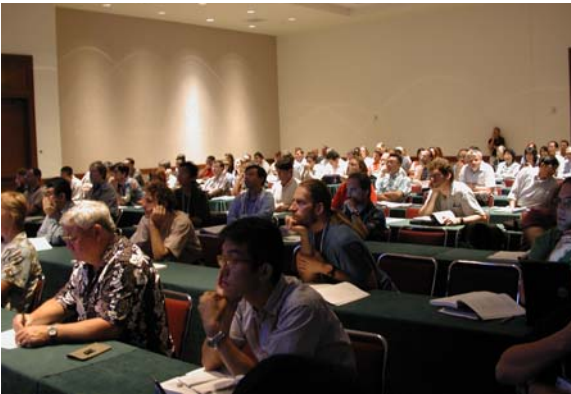
A scene at the well-attended Session on “Mechanisms that regulate North Pacific ecosystems: Bottom-up, top-down or something else?”.