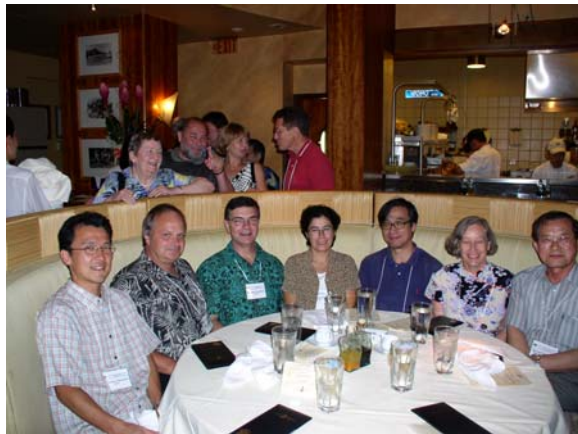
A very satisfied and well-fed bunch at the Extravaganza Dinner, held at Alan Wong's Restaurant this year.