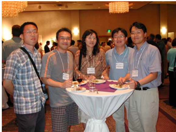
A group of young Korean scientists at the Welcome Reception.