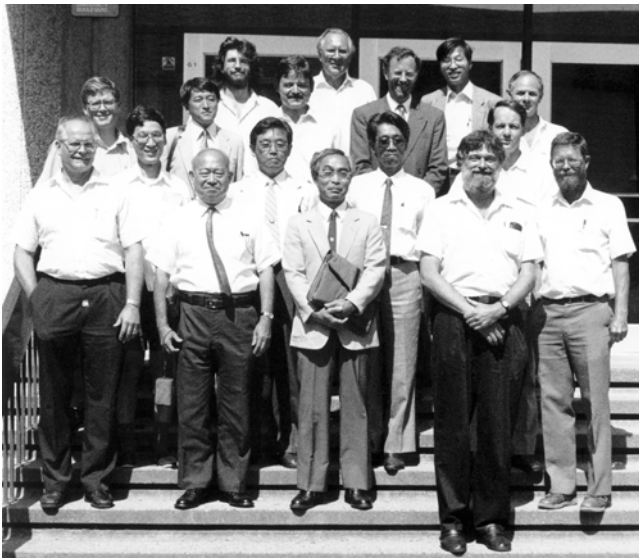
A photo with colleagues, many of whom are familiar faces at PICES Annual Meetings.