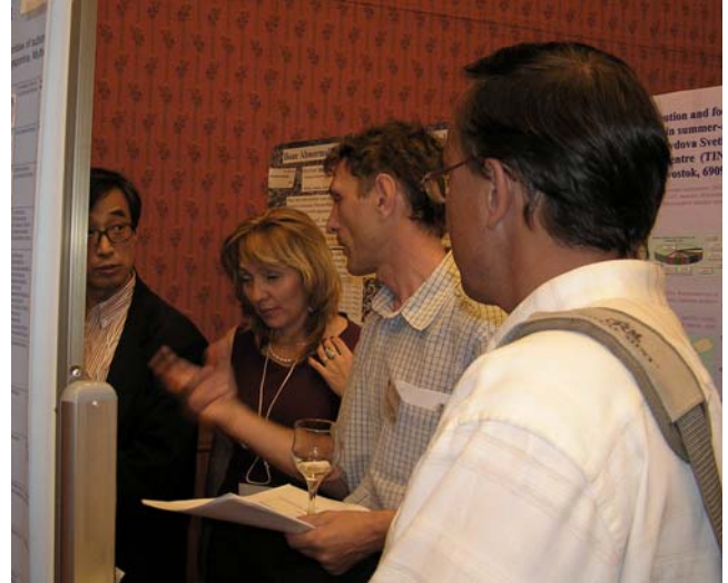
Interaction at the Poster Session.