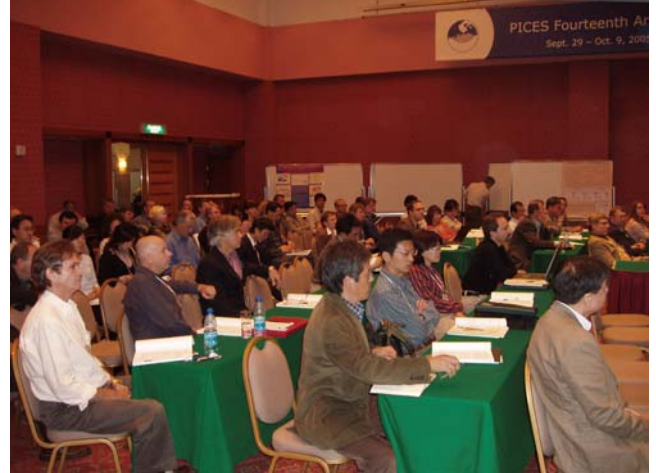
A great turnout at the CFAME Topic Session on “The comparative responses of differing life history strategists to climate shifts”.