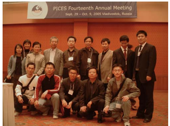
A very young Chinese delegation pose at the Welcome Reception.