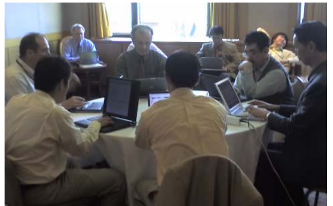
Wireless fever: the Multi-Purpose Room packed with work-focussed participants.