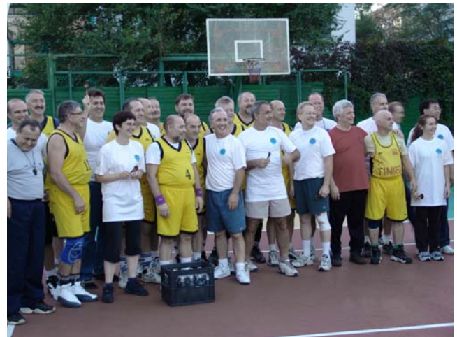
After a very vigorous basketball match, the PICES and TINRO teams pose for a friendly group photo before the prize (also in photo - 1 crate of vodka) was consummated.