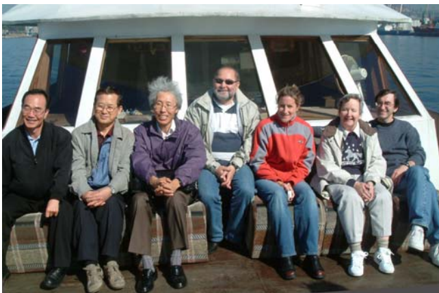
Governing Council representatives on a harbour cruise in sunny weather after the final meeting on October 9.