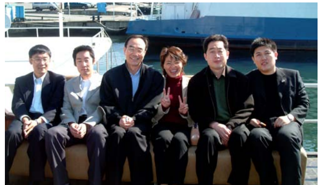
Governing Council representatives from China, Japan and Korea mingle and relax before the harbour cruise.