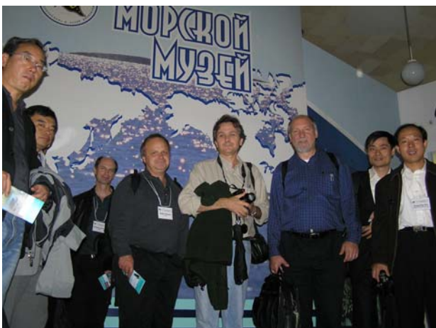
TCODE members' special excursion to the Marine Museum of the TINRO-Center.