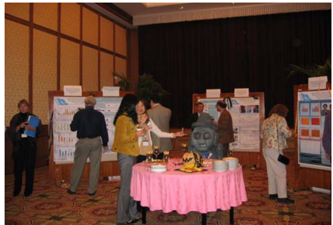
Symposium Poster session.

A major threat to the future management of Pacific salmon is climate variability. Natural variability has several modes, but it is the regime scale that appears most influential for Pacific salmon. A number of speakers addressed the issue of the impact of climate variability but it was apparent that global warming impacts are not well discussion topic at the end of the symposium. What will the future oceanographic regime look like in the North Pacific? Will global warming enhance the natural cyclic changes or will winter storminess become weaker resulting in reduced mid-ocean upwelling and reduced Pacific salmon abundance?