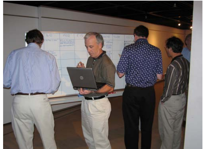
Science Board members busy trying to put together the scientific schedule for the next Annual Meeting.