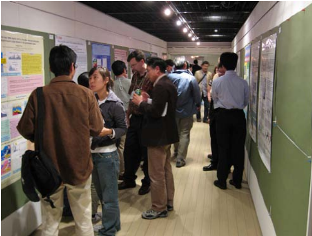
Full and clever use of all the corridors was made to accommodate the many posters submitted at PICES XV.