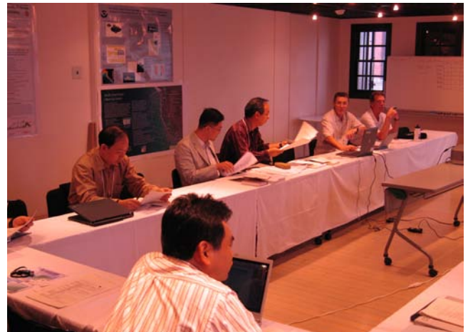
The TCODE Technical Committee Meeting in session.