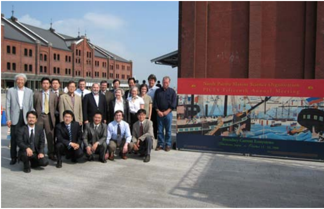
Representatives on the Governing Council pose outside the Red Brick Warehouse beside a giant PICES XV poster stand.