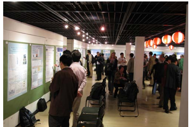
Participants eat, drink and chat amidst a Japanese matsuri (festival) atmosphere at the Poster Session Reception.