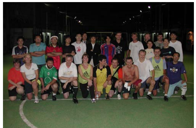
Soccer stars of tomorrow (or yesterday?!) at the PICES XV Soccer Match! PICES was represented by senior scientists, institute directors and organization/program heads from 4 continents, but, alas, lost to the young and energetic host team 1:3 and 2:5 in two friendly matches. The exciting matches were enjoyed immensely by everyone who played or watched.