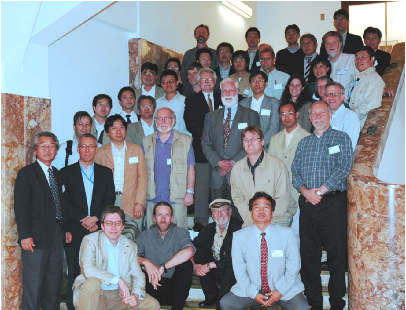
Participants at the ESSAS Second Annual Meeting in Hakodate, Japan, June 4–9, 2007.

A common denominator for the workshop was to clarify the underlying mechanisms that regulate fluctuations in productivity and biomass at different trophic levels, especially the role of changes in seasonal sea ice cover brought about by climate fluctuations. Furthermore, the workshop participants discussed the possibility of writing