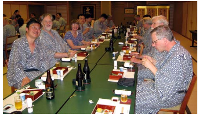
Traditional Japanese dinner after bathing in the hot springs of Hakodate.

The Hakodate experience was enlivened by a fine reception and by a visit to a hot springs spa followed by a traditional Japanese dinner. On Saturday, Professor Sakurai guided a lucky group to a fishermen’s festival in a small fishing port where we were invited to sample numerous seafood delicacies barbecued along the wharves of the village. Professor Sakurai then took us to visit a hot springs spa near Oonuma Lake National Park and, after a refreshing soak, we walked some of the many footpaths around the lake.