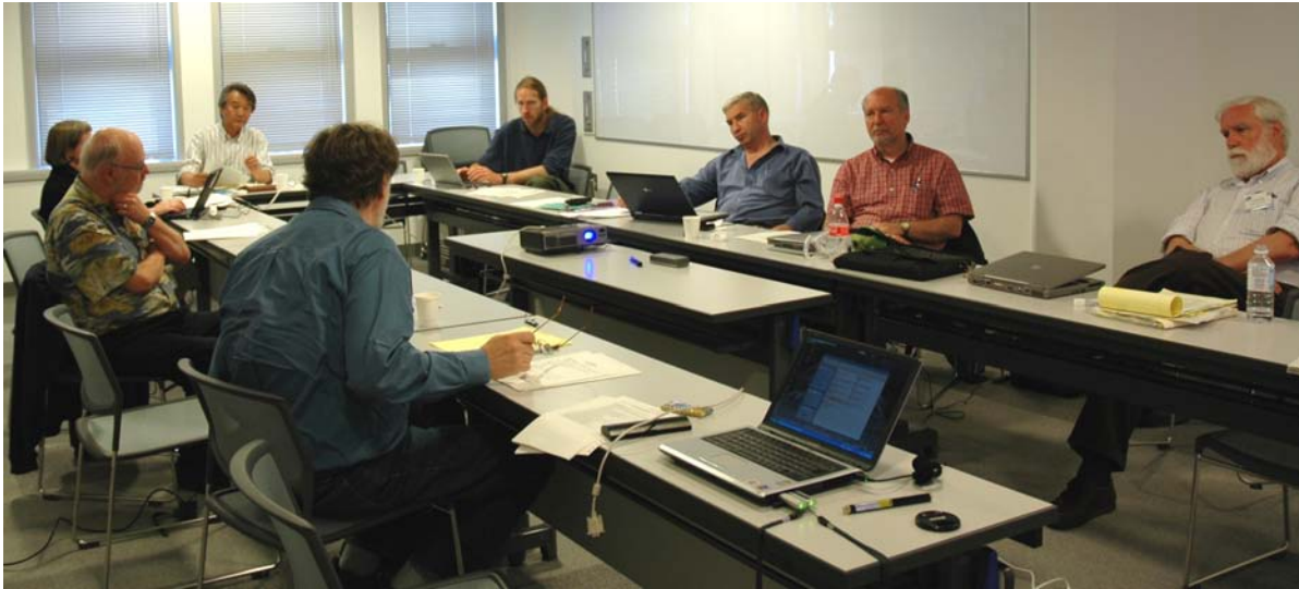
ESSAS Science Steering Committee linking research activities in the Sub-Arctic seas.

The priorities for WGRCP are to: 1) pursue and evaluate a range of IPCC AR4 model selection rules for ESSAS regions; 2) work with other ESSAS Working Groups on matching potential biological impacts from climate change to the limits of credible projections from IPCC; and 3) explore the general area of downscaling, particularly in the context of high resolution ocean models. Strong collaboration with the PICES Working Group 20 on Evaluations of Climate Change Projections is anticipated.