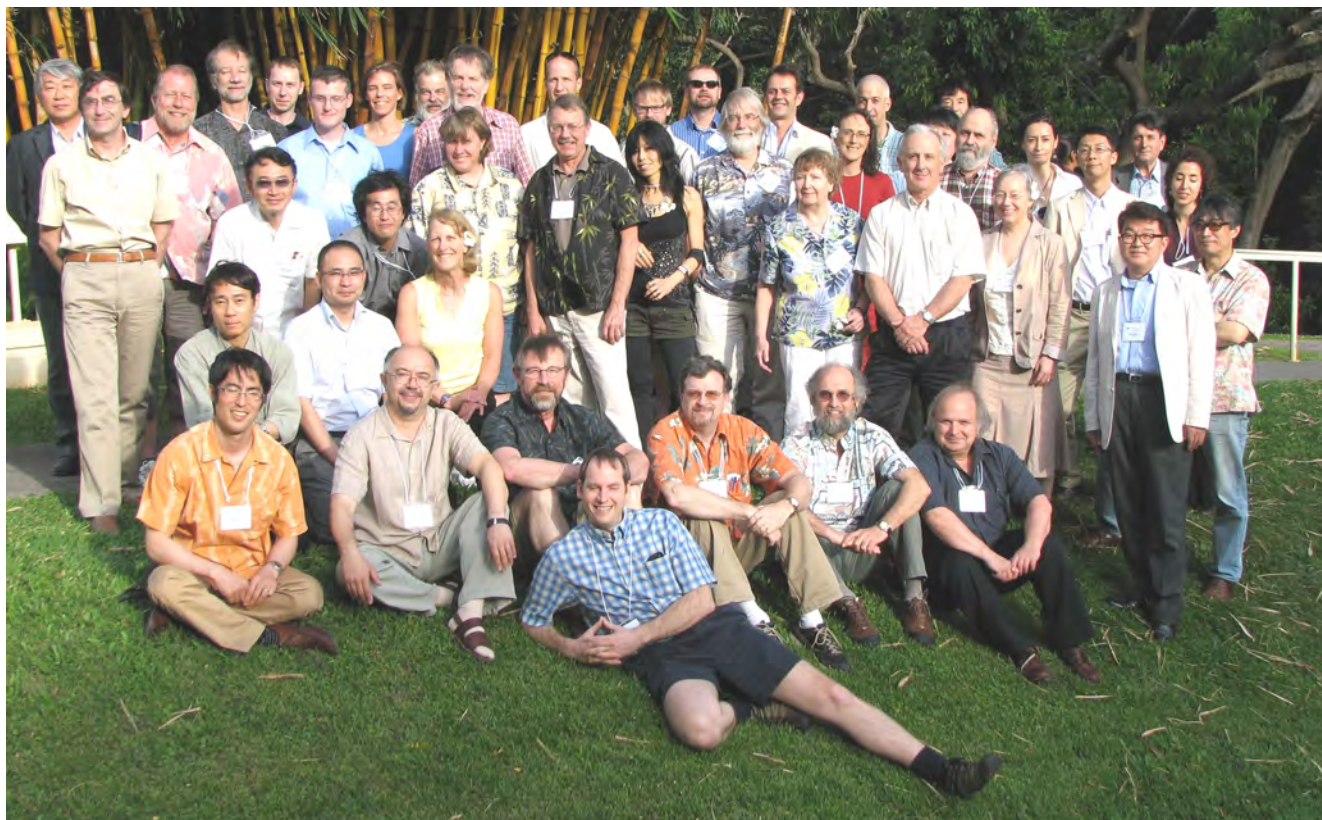
Participants of the 2011 FUTURE workshop outside of the East-West Center, University of Hawaii, Honolulu, USA.

The selection and assessment of ecosystem-level indicators has been conducted by a number of collaborative programs and initiatives elsewhere, and Marta Coll Mónton provided a thorough background on the Indicator of the Seas Project (IndiSeas), which was launched in 2005 under the auspices of the EUR-OCEANS Scientific Programme as a follow-up to the SCOR/IOC Working Group 119 on Quantitative Ecosystem Indicators . The intent of this project was to evaluate the effects of fisheries on different marine ecosystems using a panel of ecological indicators, and to facilitate effective communication of potential ecological changes. Indicators were selected based on four criteria: (1) ecological significance ( i.e. , are the underlying processes essential to the understanding of the functioning and structure of marine and aquatic ecosystems?); (2) measurability: availability of data required for calculating these indicators; (3) sensitivity to fishing pressure; and (4) awareness of the general public. In the IndiSeas approach, local experts play a critical role, especially interpreting indicator outputs.