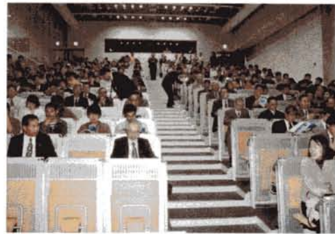
More than full attendance at the CCCC Workshop