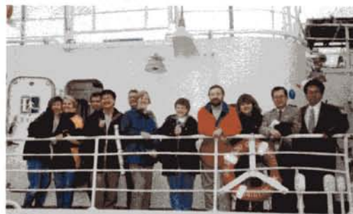
The PICES Chairman, Science Board Chairman, Secretariat, Local Organizing Committee members and Russian friends on board R/V Professor Gagarinskiy