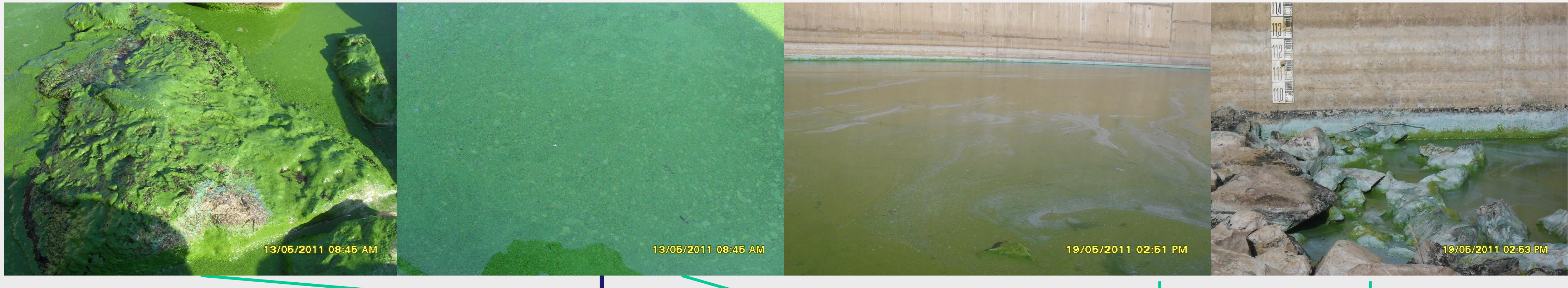
Figure 1. View of Algal Bloom at Corumana Reservoir

The result of the present study might be a contribution to the knowledge of the biogeography of toxic cyanobacteria in African countries, but also raise the need to extend the cyanobacterial education to elucidate the water managers and local the people how to handle the situation when this kind of phenomenon occurs.