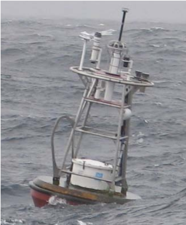
OCS Papa mooring in 4-m seas during February 2008 Line-P cruise.