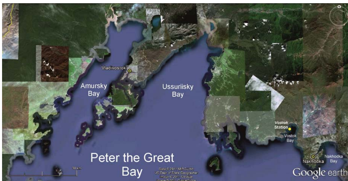
Peter the Great Bay region, including Vladivostok, on the Muravyov-Amursky Peninsula and Vostok Bay to the east.

The 2011 RAS was conducted in Peter the Great Bay, near Vladivostok and Nakhodka, the largest Far Eastern Region seaports of Russia. The survey was based at the Vostok Marine Biological Station of the A.V. Zhirmunsky Institute of Marine Biology (IMB) of the Far Eastern Branch of the Russian Academy of Sciences, which is located about 2 hours away in Vladivostok (see photo below). The Vostok Station, on the coast of Vostok Bay (an eastern extension of Peter the Great Bay), was established by the IMB in a comparatively clean area with diverse surrounding habitats to serve as an international base for marine studies. The biodiversity in the area has since become relatively well described due to continuous studies by scientists from all over the world.