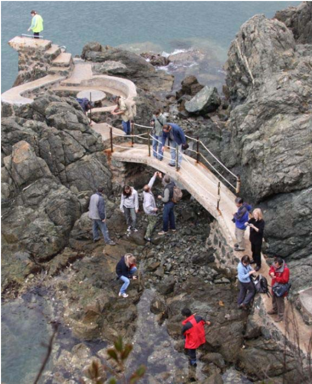
Participants of the PICES Rapid Assessment Survey on the rocky shore of Anna Bight, Anna Lighthouse Resort Point, near Vostok Bay, October 9, 2011.