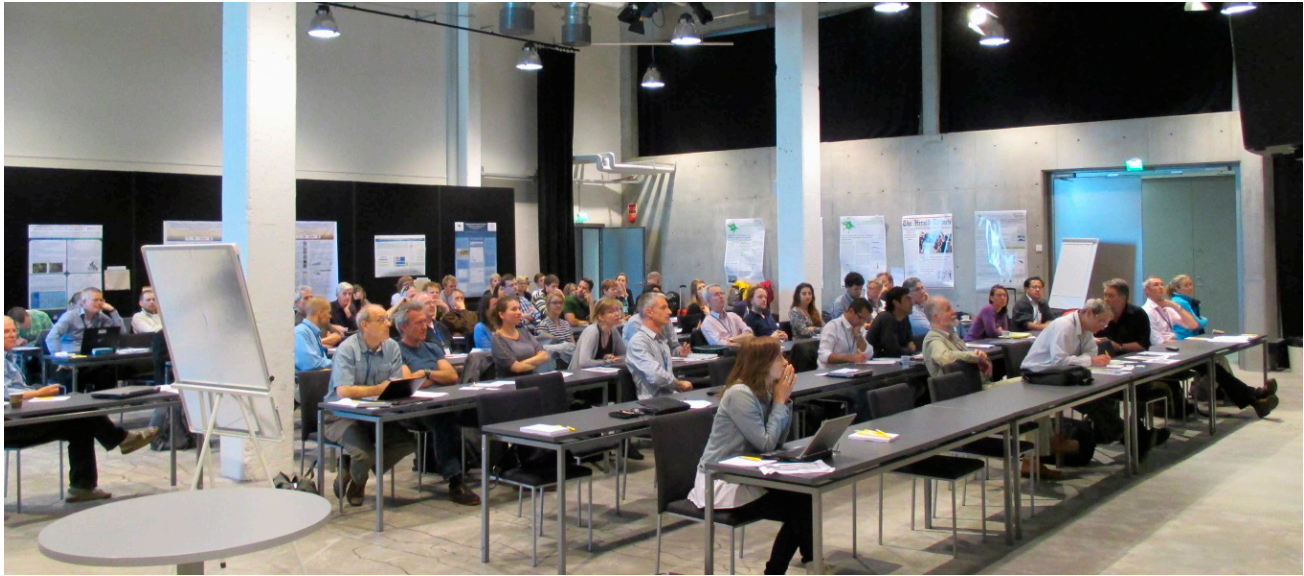
Fig. 3 The symposium in session.