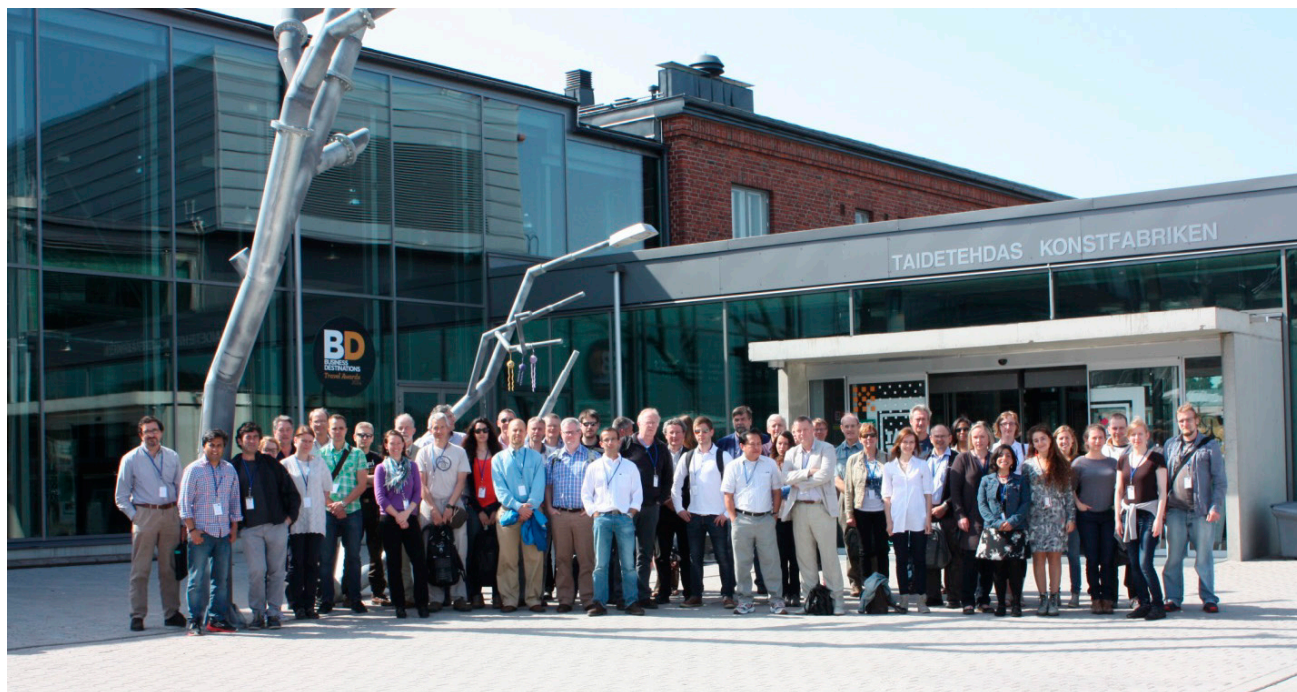
Fig. 1 Participants of the ICES symposium “ Ecological Basis of Risk Analysis for Marine Ecosystems ”, June 2–4, 2014, at the Art Factory in Porvoo, Finland.

The world’s marine ecosystems are facing an increasing number of challenges. Fishing intensity is high, and there are several other threats such as possible oil spills from drilling and transportation, climate change, eutrophication, and risks associated with aquaculture. The aggregate analysis of multiple interacting risk factors is a challenging task for scientists. While risk assessment methods are well established in scientific disciplines like finance, health, and insurance, they are less established in resource management and climate change.